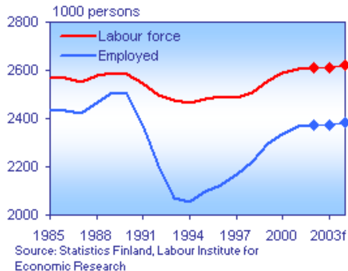
Figure 4. Labour Supply and Employment 1985 - 2004

This year unemployment will start to rise slightly and the unemployment rate will climb to 9.2 per cent. The number of unemployed persons will average 241,000. The cyclical slowdown in the growth of the labour supply and an increase in the number of persons participating in active labour policy measures will curb the rise in unemployment. In particular, the number of persons participating in job training programmes has increased at the beginning of this year.