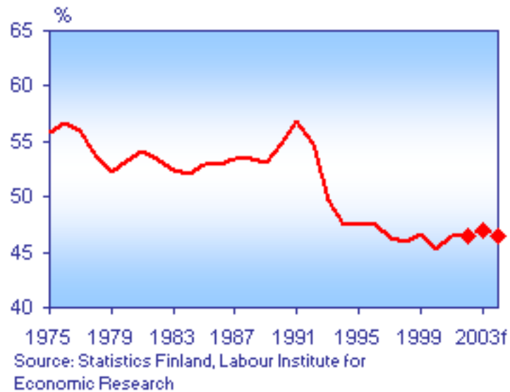
Figure 3. Labour Share in the Private Sector 1975 - 2004

The purchasing power of households is forecast to rise this year by about 2 per cent. The making of precise forecasts is hampered by the fact that decisions about taxation with consequences for purchasing power have not been made yet. The forecast does not include changes in taxation other than ordinary adjustments to the tax rates for inflation.